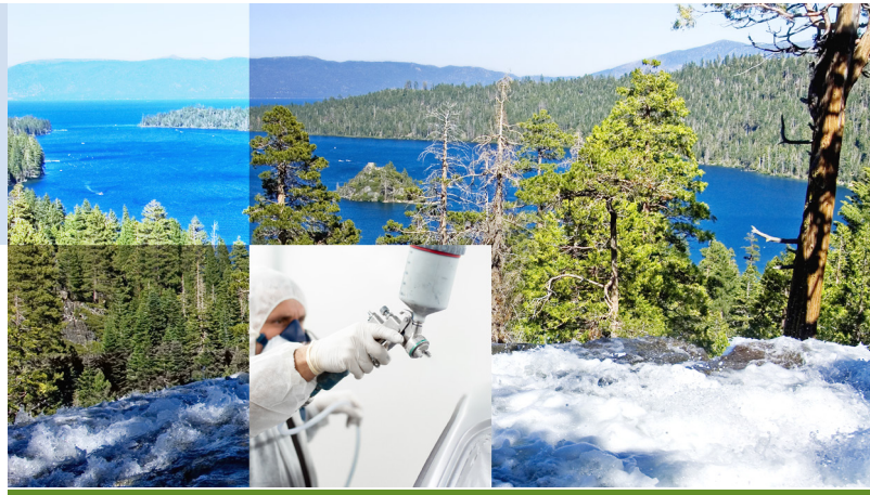
Dust Particle Decay