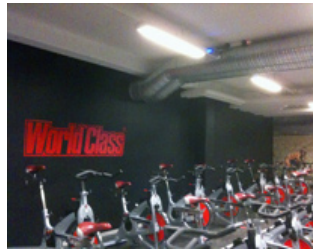
Aircode™ RX-100 Installed on the roof at World Class Masthugget

Aircode™ were introduced to us by mouth to mouth. We installed the product in parts of our facility where we felt that most would benefit and where the effect of odors, sweat and dust were an issue.